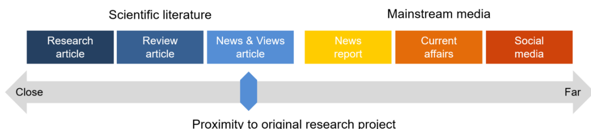
Figure 1. Proximity of News & Views articles to original research, situated among the broader scientific literature and mainstream media.

You will need to choose a recent, high-impact discovery published by BDI researchers in the period 2021-2022 . For the publication you choose, the first or last author must be from the BDI . The researcher associated with this discovery can be the same as the lab head you have investigated in MAT2 but you are free to choose a new researcher/area. Examples of discoveries you may choose to look at might include a new therapeutic development, a new understanding of a molecules structure or function, a new biomedical technique or advancement.